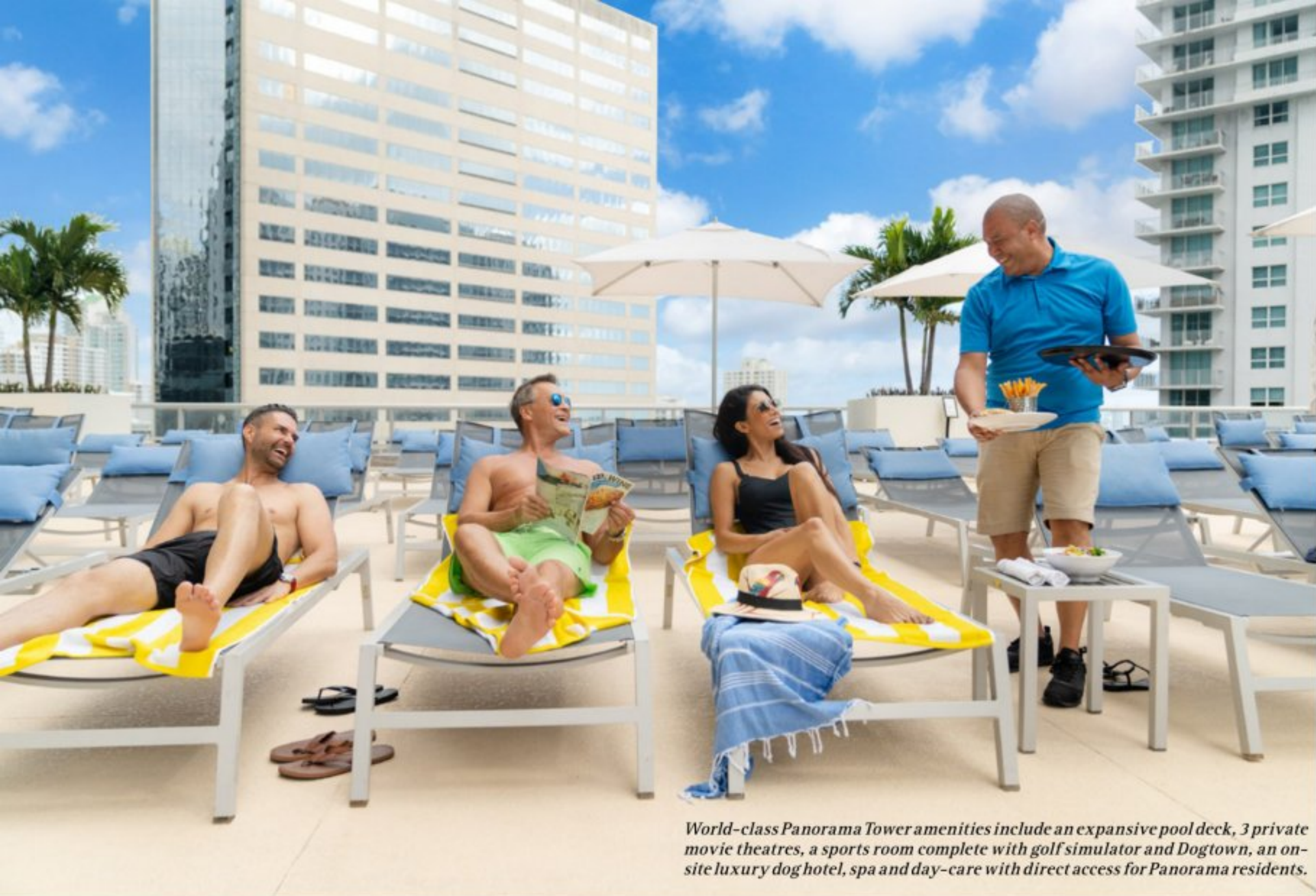
World-class Panorama Tower amenities include an expansive pool deck, 3 private movie theatres, a sports room complete with golf simulator and Dogtown, an on-site luxury dog hotel, spa and day-care with direct access for Panorama residents.

P anorama Tower defines the peak of chic luxury rental living in Brickell. At 85 stories, Panorama is currently Florida's tallest tower and the tallest residential tower south of Manhattan, showcasing 821 luxury rental units and over 100,000 sq. ft. of amenities. Expansive units offer 9-foot ceilings, floor-to-ceiling windows and unmatched, sweeping water views and panoramic vistas of all of Miami. Individual units range from 1,100 sq. ft. to over 2,100 sq. ft., with a variety of 1-, 2- and 3-bedroom floorplans. Thanks to endless opportunities for exceptional living, residents enjoy a wide array of extraordinary amenities, including three movie theaters, a wine tasting room, children's playroom, and state-of-the-art fitness center complete with yoga, Pilates and spinning studios. There's also Dogtown Brickell, situated on-site, with direct access for Panorama residents. The all-inclusive free-roaming luxury dog hotel, spa and daycare features fun-filled daycare services and pet grooming.